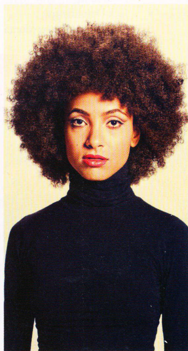
► Best Electric Bassist: Esperanza Spalding