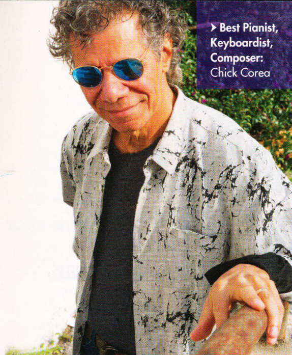
► Best Pianist, Keyboardist, Composer: Chick Corea