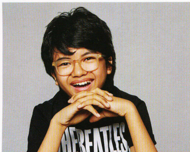
► Artist of the Year, Best New Release, Best Acoustic Group: Joey Alexander

Readers were asked to focus on artists' achievements that occurred between November 2015 and November 2016. Winners are bolded; runners-up are listed below in order of number of votes. An asterisk* denotes a tie.